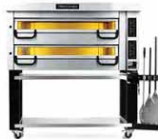
Model shown: PM 832ED, including optional equipment