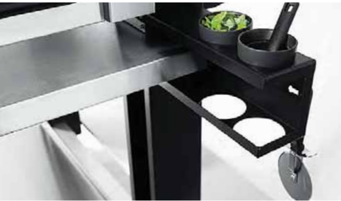
Oil - and spice rack for final touch