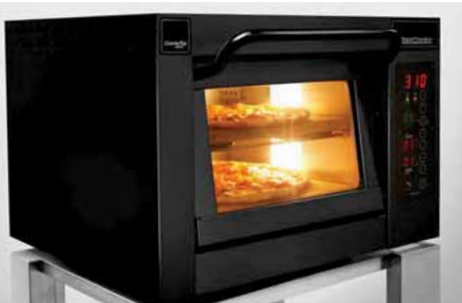
PM 351ED-1 made in Phantom Black