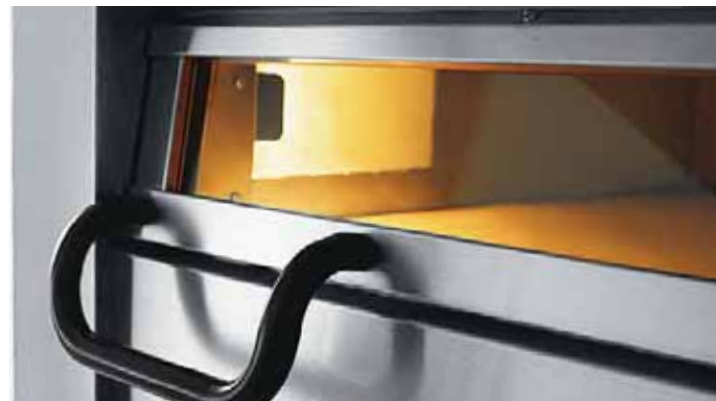
Robust, smoothly-opening door with large window and ergonomic handles