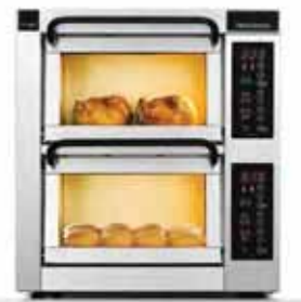
Model shown: PM 352ED