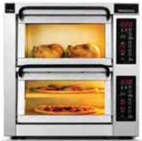
Model shown: PM 402ED-1