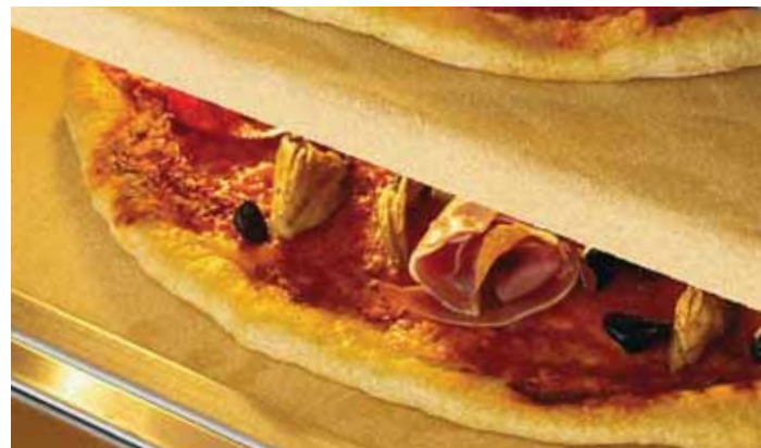
Each oven chamber can be divided easily into two decks by fitting an intermediate hearthstone and element, which doubles the oven capacity.