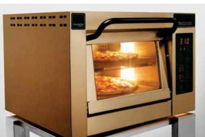
PM 351ED-1 made in Royal Gold