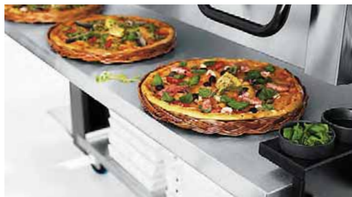
Retractable frontal unloading shelf lets you make or save space quickly and easily