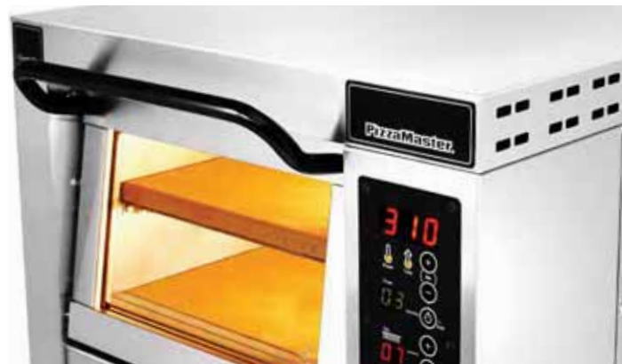
Sleek, brushed stainless-steel surfaces, virtually seamless joints and no visible screws or rivets make the oven very smart and easy to clean.