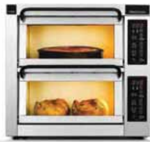
Model shown: PM 452ED