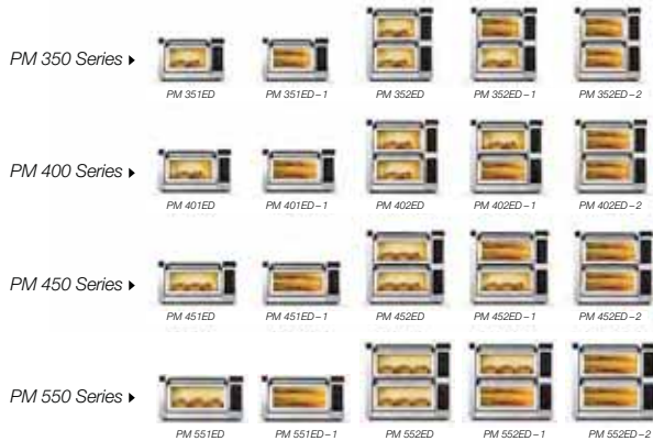
CounterTop Series Standard Width