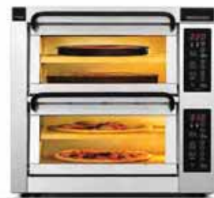
Model shown: PM 552ED-2