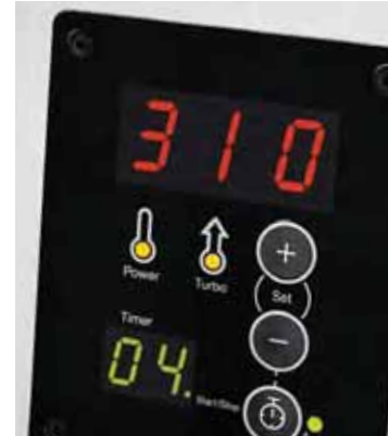
Digital or classic control panel - both logical and easy to use