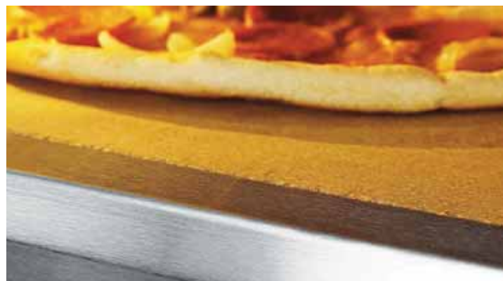
Hearth of natural material, with crisping function for perfect texture and flavour